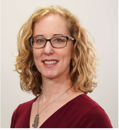
KEYNOTE SPEAKER Lorna Slater MSP Minister for Green Skills Circular Economy and Biodiversity

Lorna Slater was reappointed as Minister for Green Skills, Circular Economy and Biodiversity in March 2023.